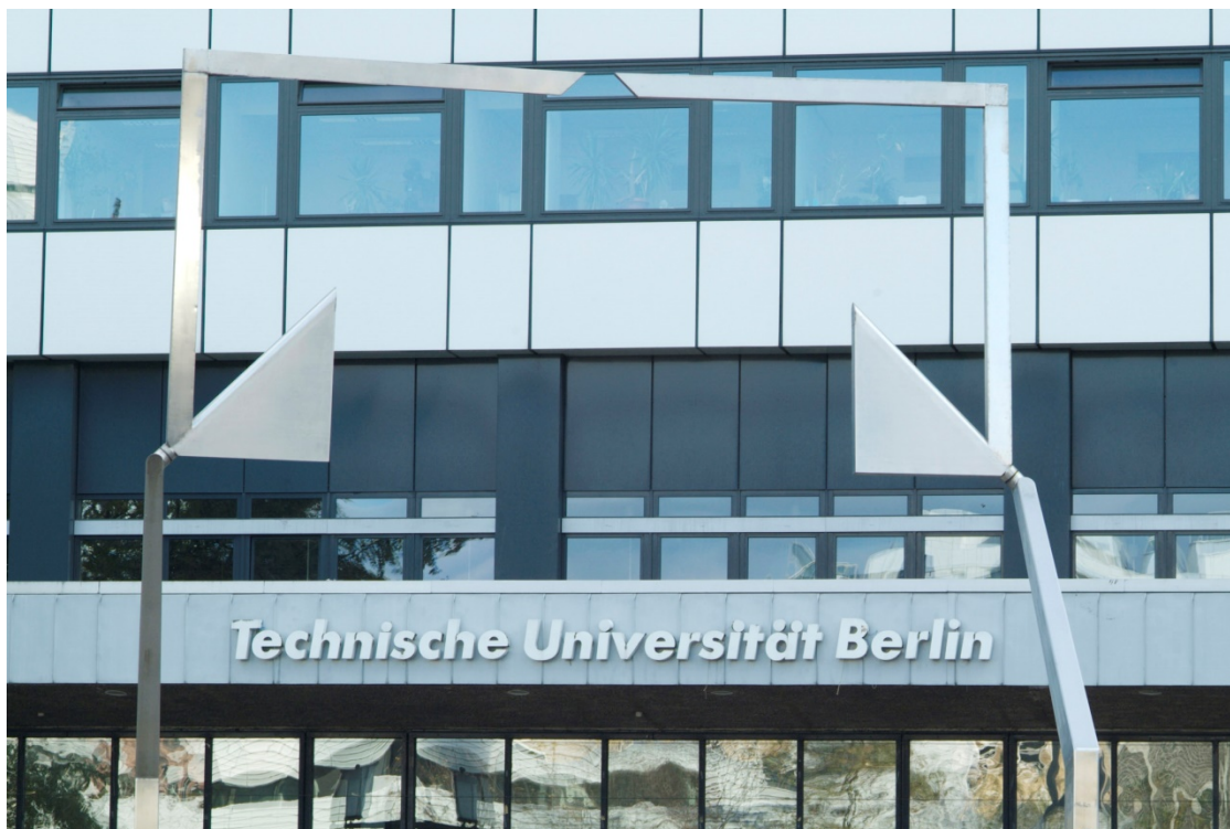
Entrance of the TU main building