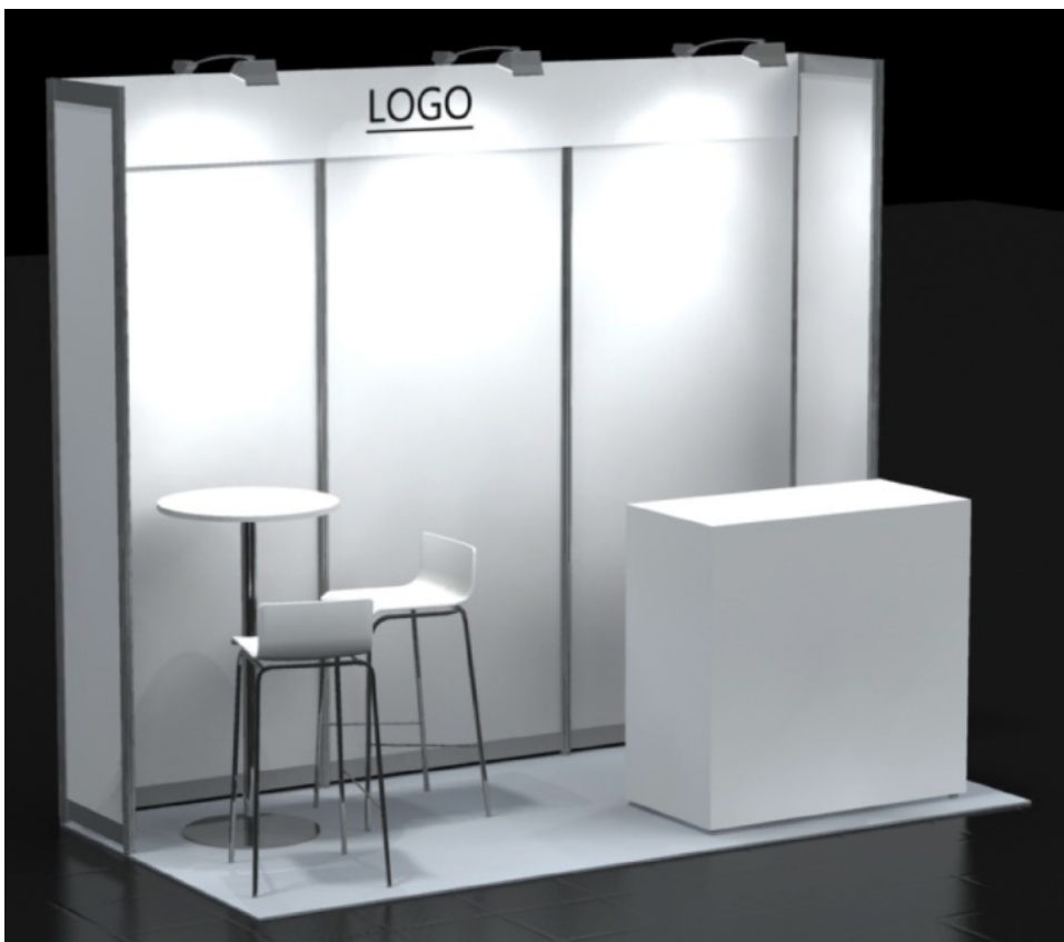
Example for Exhibition booth, 9 square meters