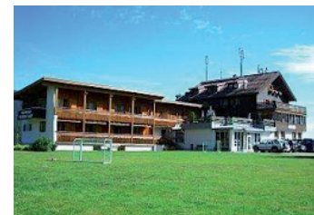
Mountain guesthouse „Darmstädter Haus“ of TU Darmstadt in Hirschegg