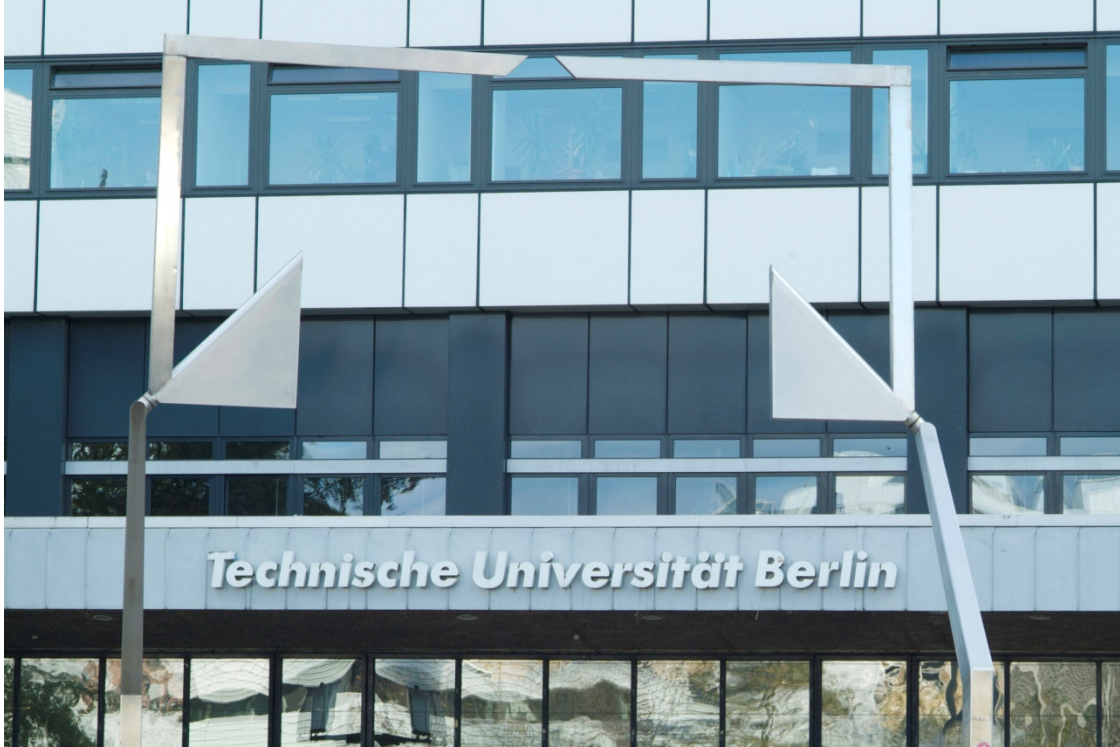
Entrance of the TU main building