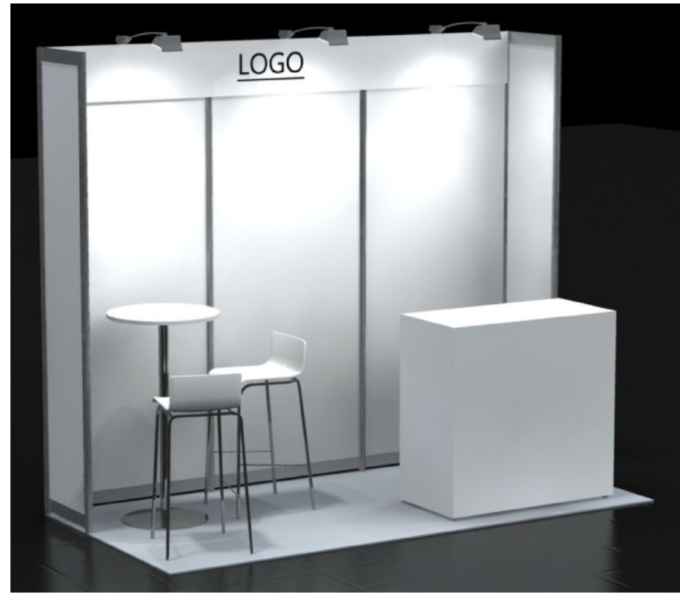
Example for Exhibition booth, 9 square meters