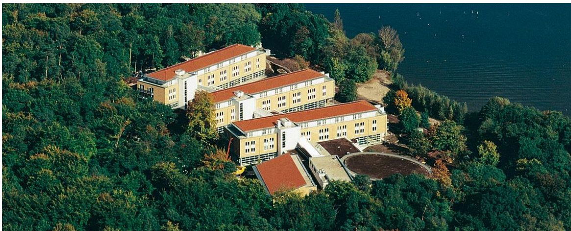
SEMINARIS SeeHotel Potsdam