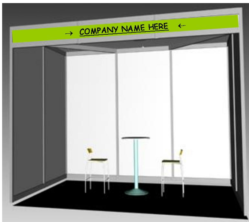
Figure 2: layout of the 2x3m 2 booth, shown here in the barstool option