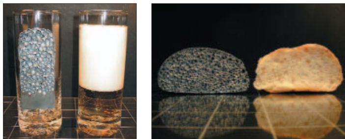
Fig. 1: left: aluminium foam blown with air from a particle-stabilised melt and beer, right: zinc foam and bread roll, both foamed by internal gas creation