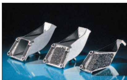
Fig. 2: Foamed part of aluminium dedicated for BMW engine mounting bracket

Metal foams are challenging materials for both fundamental and applied research. They distinguish themselves from other materials by low density, high specific stiffness, and high-energy absorption capability. Therefore, they become increasingly popular for industrial applications. Like all other foams, metal foams are produced in the liquid state. Liquid metal foams, by definition, are collections of gas bubbles uniformly dispersed in a liquid metal separated by self-standing thin liquid films. Two methods for foaming metals, distinguished by the way the gas enters the melt, i.e. by the gas source, are used. Bubble creation can be external or internal . In the former case, gas bubbles are created by continuous gas injection. The foam accumulates at the surface of the melt and the result resembles a glass of draught beer. In the latter method, gas-releasing propellants – akin to the blowing agents of yeast used by bakers – are added to the melt or compacted powders (Fig. 1 and 2).