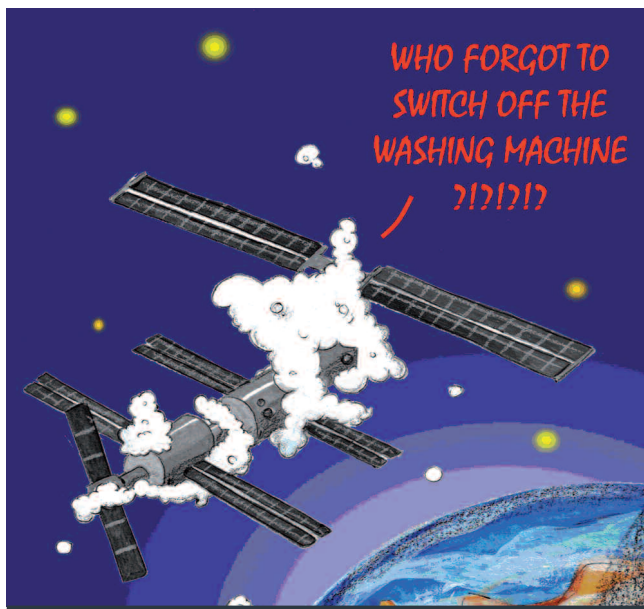
▲ FIG. 3: The future of foam research on the ISS?.