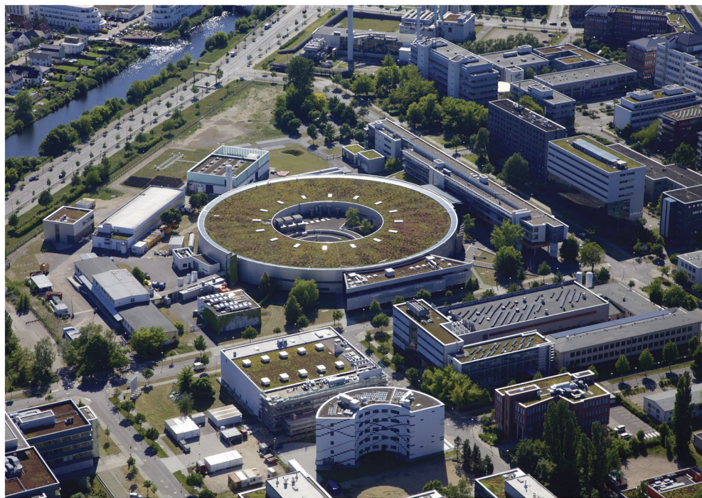
Figure 3: A garden on the roof! Located in Berlin-Adlershof, one of Germany's biggest technology parks, BESSY II is easily recognizable from the air.