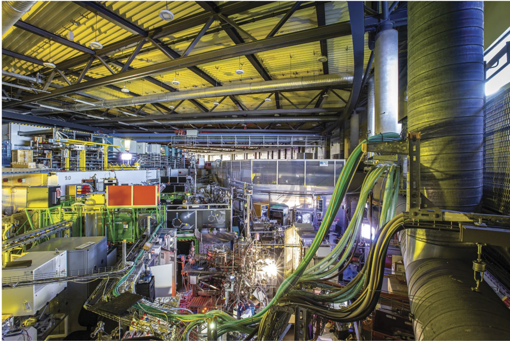
Figure 1: Experimental hall of BESSY II at night. Thanks to a very long exposure and only one yellow light, this picture reveals a new perspective on this place.